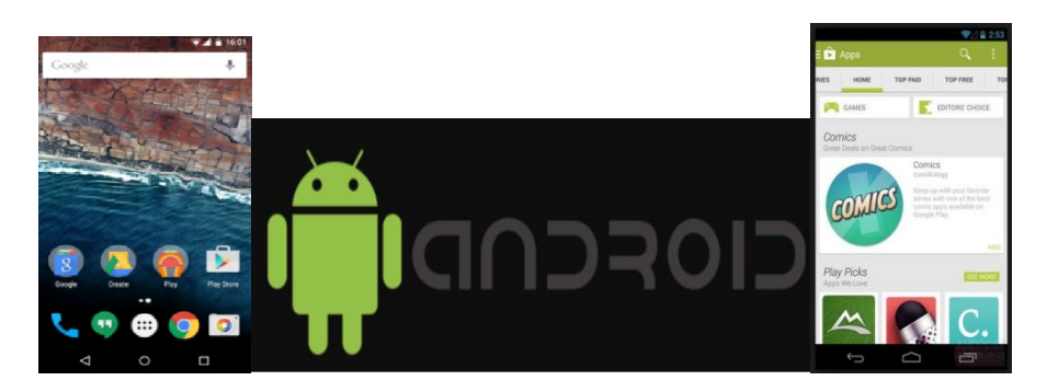
Fig 3. Android Home Page